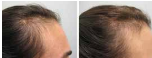
DAY 0 DAY 90