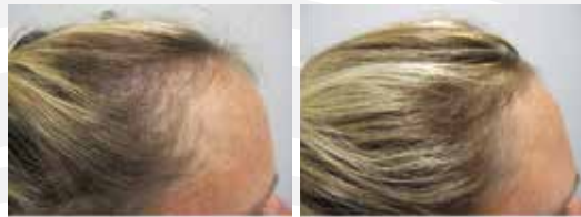
DAY 0 DAY 90

Viviscal was originally developed in the late 1980s in Scandinavia, and the first clinical trial proving its efficacy was published in 1992 in The Journal of International Medical Research . Since then, we have conducted numerous trials internationally to prove the efficacy of Viviscal supplements.