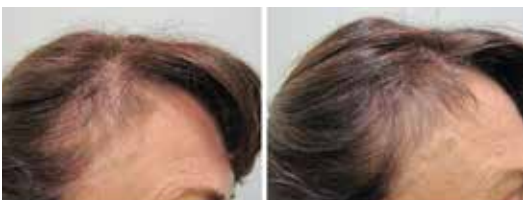
DAY 0 DAY 90