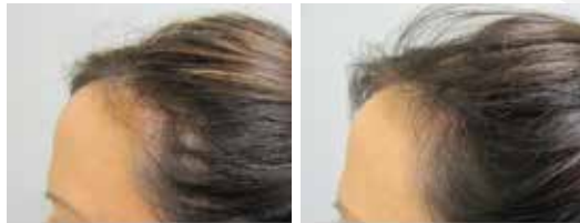
DAY 0 DAY 90